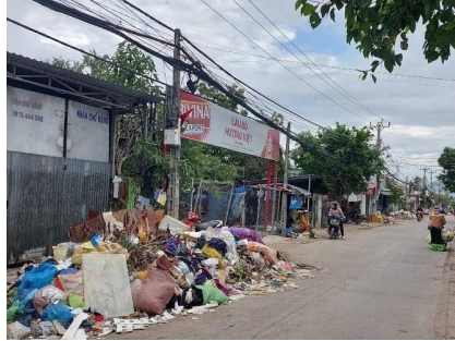
Lots of trash!