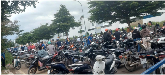
Motorcycles are repaired for free; the state pays!