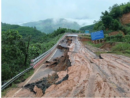
Road between Dalat and Nha Trang was broken!